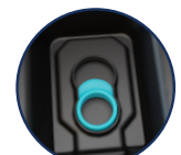
Peanut Lock only DTP-TC