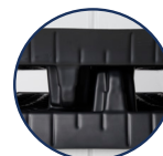
SP Interlocking Pallet Legs