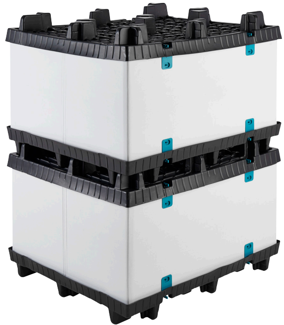
Big Pak SP