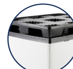
DTP-TC Interlocking Pallet and Cover